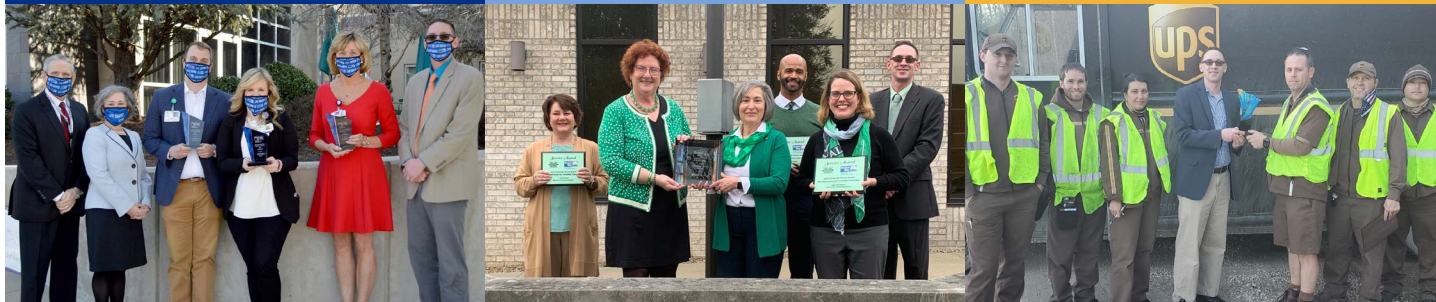
Mountain Health Network Pillar Partner