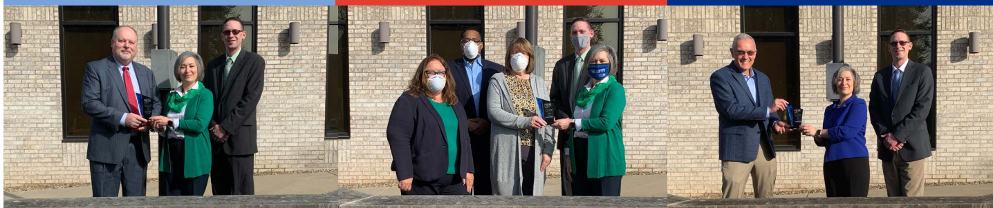
Huntington Federal Cornerstone Partner