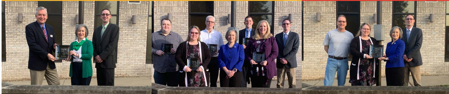
Huntington YMCA Comeback Campaign