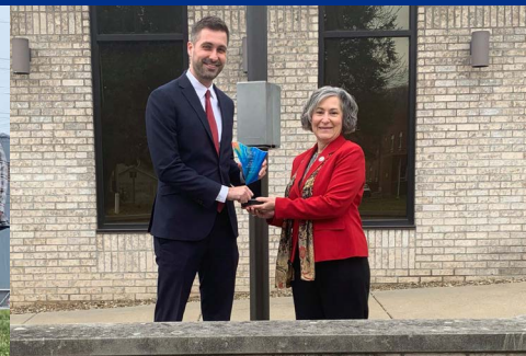
WSAZ Small Business of the Year