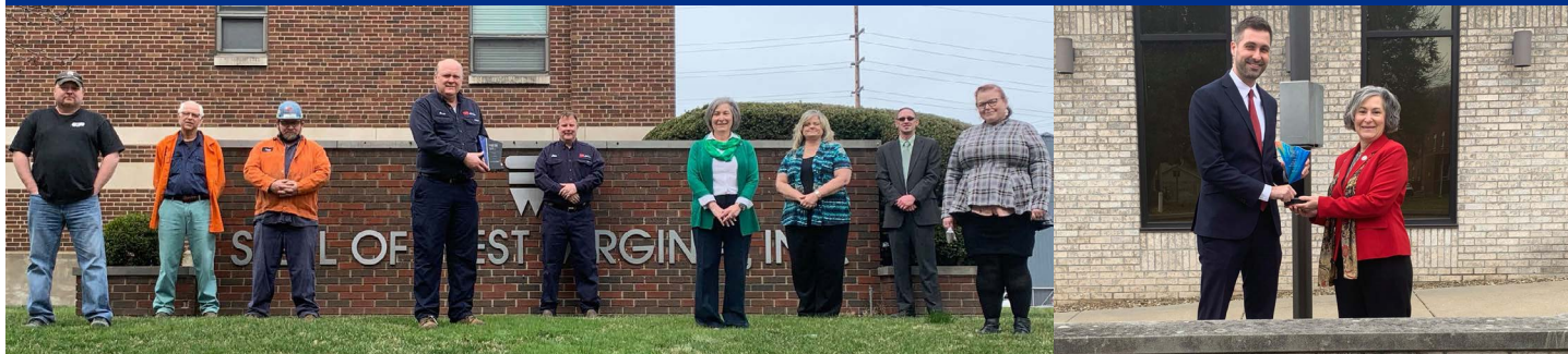
Steel of West Virginia Visionary Partner & Large Business of the Year